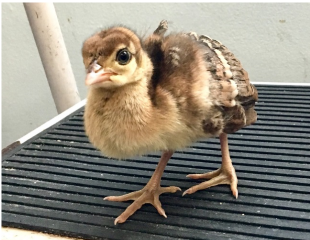
[Left] Peafowl chick

Range: They tend to roam in spring and summer until they have found a suitable home range. Then, they may remain resident in that area. Males will defend a territory in the breeding season. Single males may roam all year long.